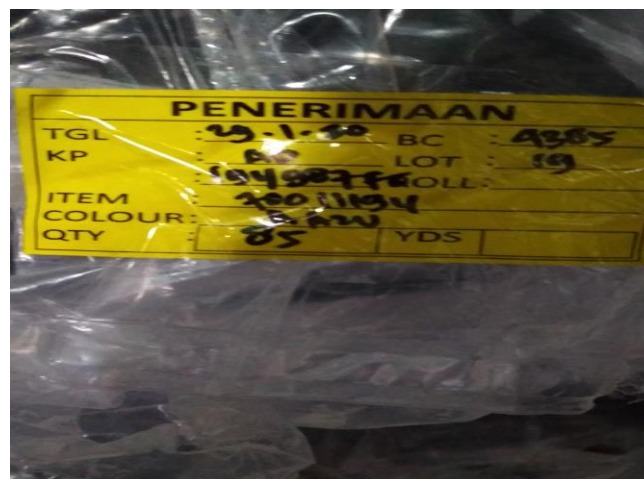
Lampiran 2 Sticker Identitas Fabric