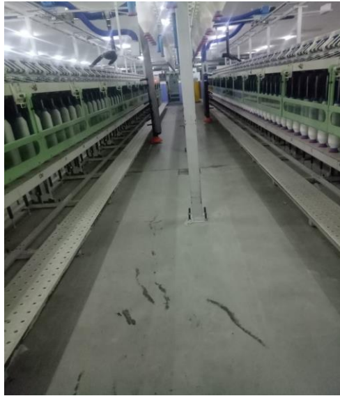
Lampiran 14 Jadwal Scouring Mesin Speed Frame