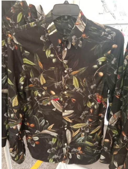
Tampak Depan Luar

Lampiran 1 Produk Jadi H&M Moss Viscose Shirt Autumn Botanical